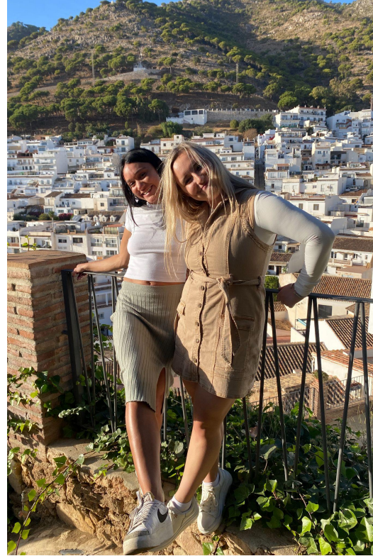
PIC: MIJAS PUEBLO